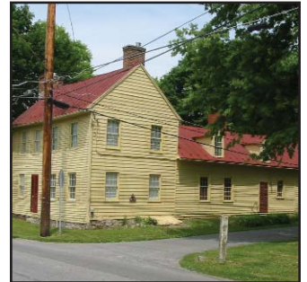
#16-Virginia Inn (Old Tavern)