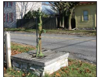
#44-Town Well (passed earlier on the tour)