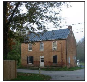
#24-Civil War Hospital

This early brick house, possibly from the 18th century, was used as a hospital during the Civil War and housed soldiers injured during the battle of Antietam. It was used as a general merchandise store during much of the 19th century operated by the J. W. Grantham family.