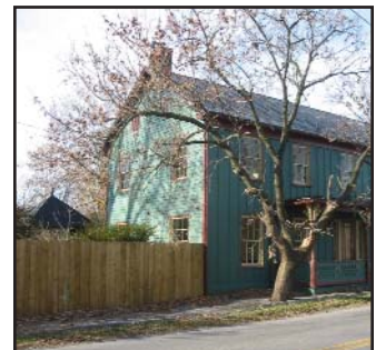
#6-Daniel Fry House