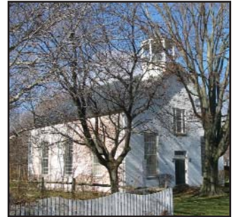
#18-Union Church & Cemetery

This house was originally built as a two-story brick house about 1830. It served as the rectory for the Grace Episcopal Church for some 110 years. The exterior has changed little since 1864.