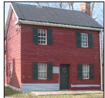
#5-Built in 1790s