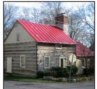
#35-Late 18th/Early 19th Cen.

35. This house is a fine example of an early Middleway log house built in the late 18th or early 19th century. Its original clapboard exterior was removed during recent renovations.