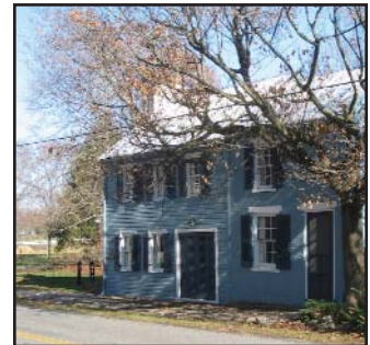
#10-Old Village Shoemaker