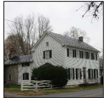
#26-Colonial Era House

This early cemetery contains some graves of soldiers killed during the Civil War, including the Battle of Smithfield.