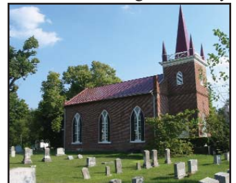
#20-Grace Episcopal Church